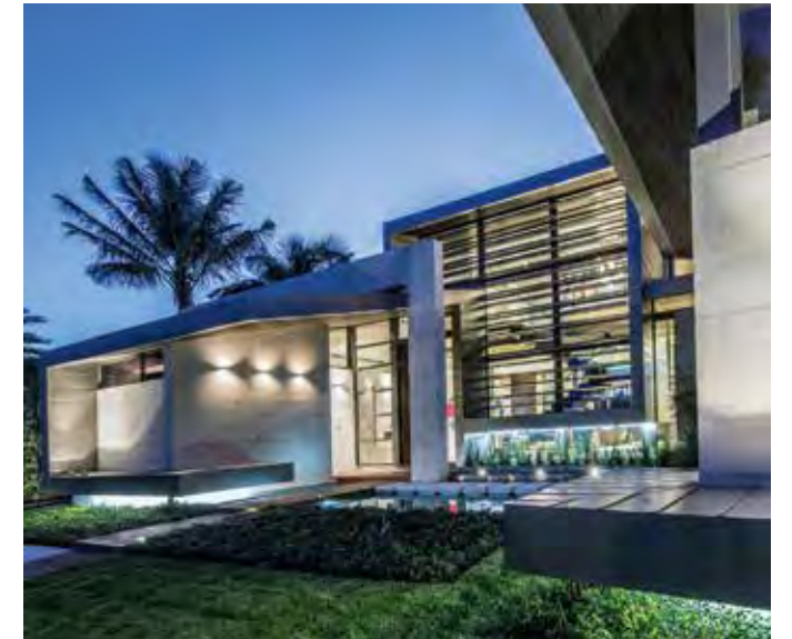
A dramatic mahogany wood staircase can be seen from the entry of the residence.