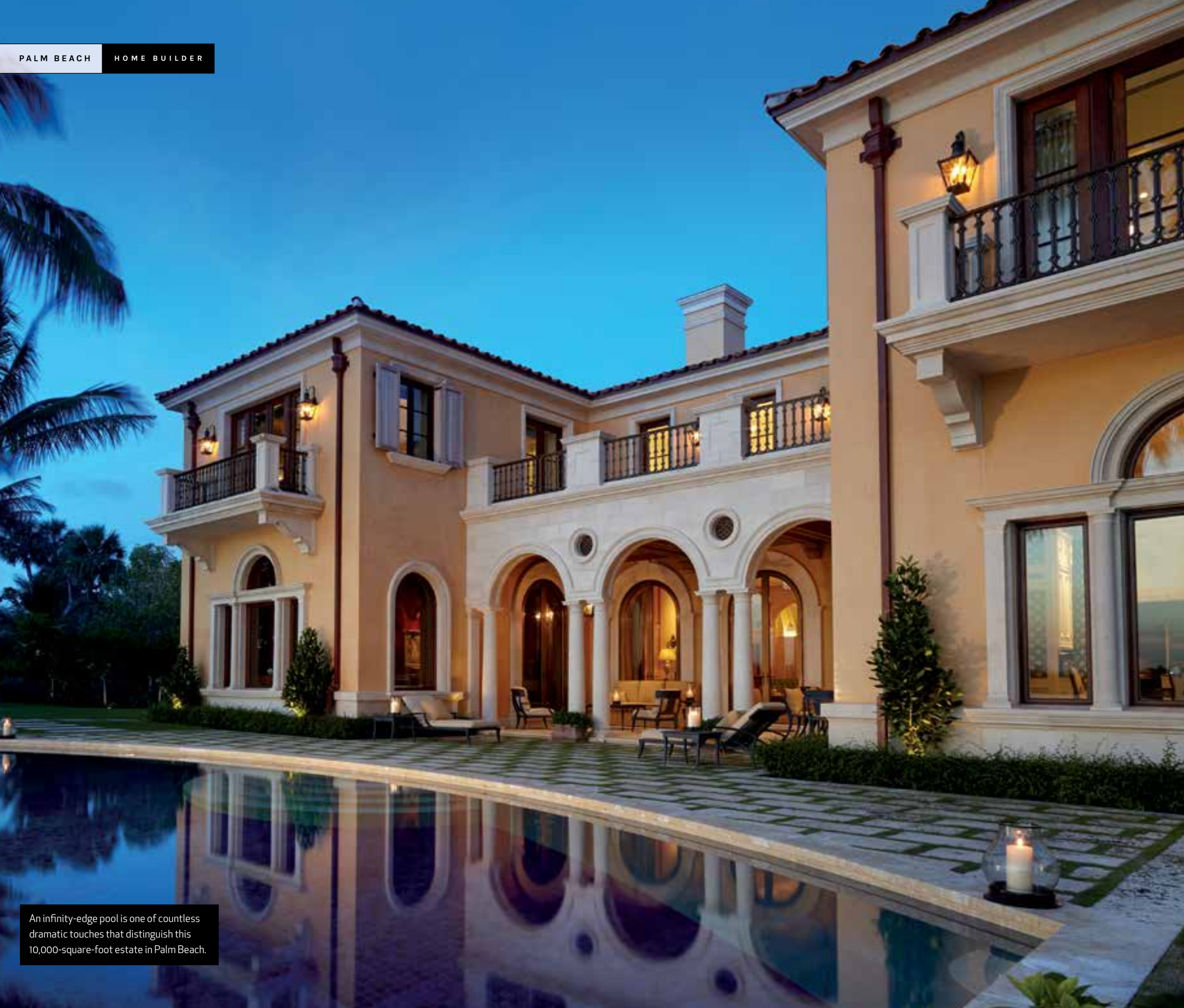
An infinity-edge pool is one of countless dramatic touches that distinguish this 10,000-square-foot estate in Palm Beach.